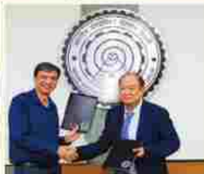
MoU signing with NYCU