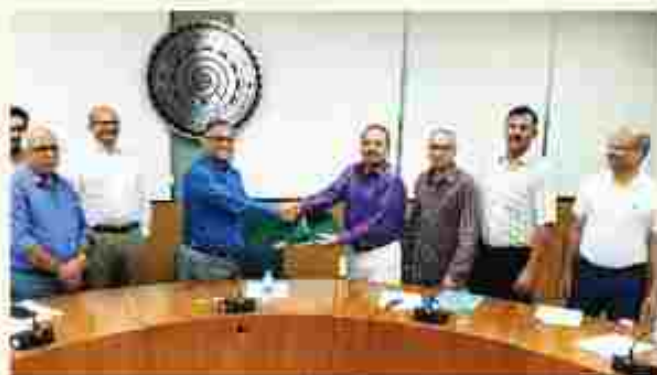
MoU signing with THDCIL