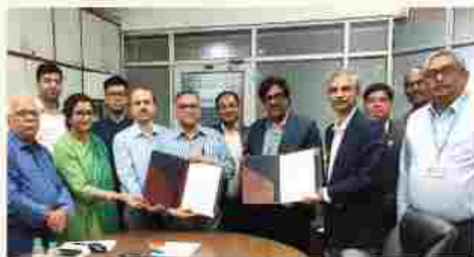
MoU signing with BPCL