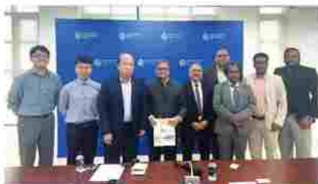
Visit of IIT Delhi delegates to NYCU