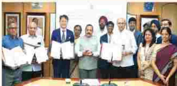
MoU signing with WIPO