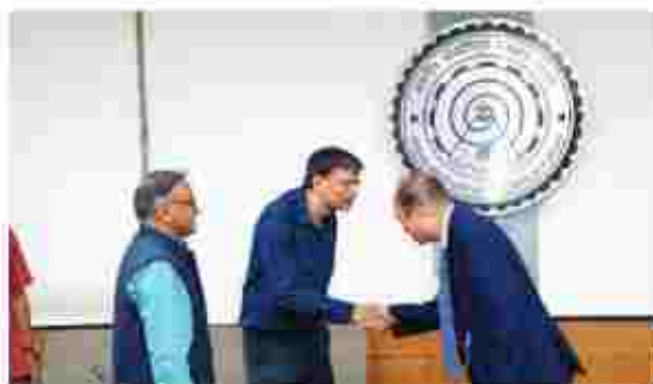
Visit of NYCU delegates at IIT Delhi