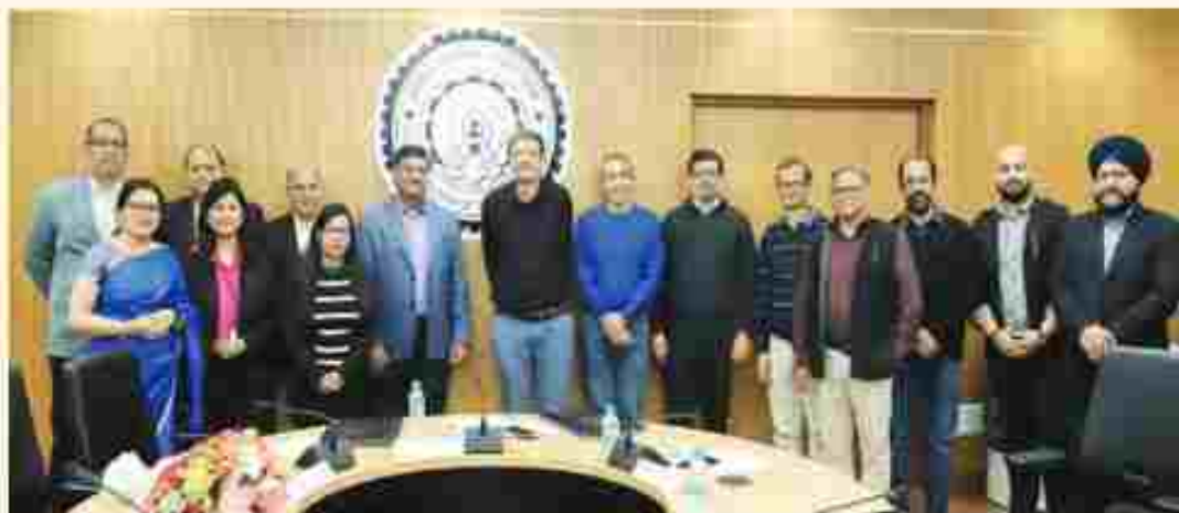
MoU signing with R Systems